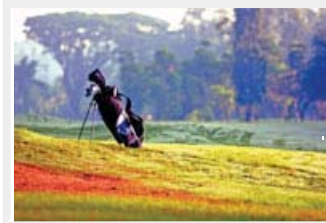
Golfing in Bangalore

The first Jack Nicklaus Signature Golf Course for RIRIC is currently under construction in Bangalore, India. The project is the flagship for RIRIC's series of new master planned towns that will all feature Jack Nicklaus Signature Golf Courses.