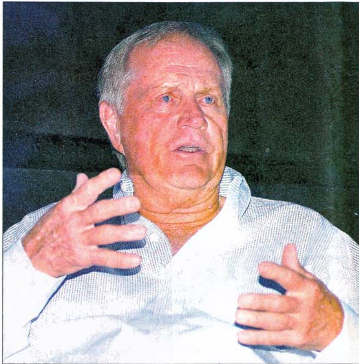
Jack Nicklaus says Tiger Woods needs to stay fit to surpass his all-time record.

need to build tougher and longer courses to nullify the technology factor?